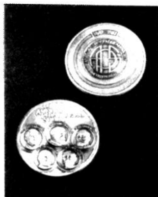
The Centennial Medallion

Centennial Medallion is a 2.5-inch bronze commemorative medallion that features the sculptured faces of the five founders on the front side and the Centennial Seal on the reverse side. The cost is $25.00 for each medallion.