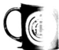
The Centennial Coffee Mug

Centennial Coffee Mug is a replica of the Founders Cup with the Centennial Seal imprinted in white on a radiant cobalt blue mug. The cost for the coffee mug is $7.50.