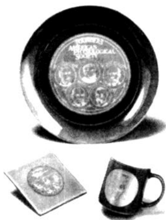
The Centennial Founders Set

The Centennial Founders Set is a limited production of ceramicware commemorating the 100th anniversary of the founding of the American Physiological Society. Each piece—plate, cup, and tile—is fired in a radiant cobalt blue porcelain and etched in 23-carat gold. The face of the 10-inch plate features a reproduction in gold of the Centennial portraits of the five founders and inscribed on the back is a brief history of APS. The tile features a gold reproduction of the Centennial Seal and the cup has both the founders' portraits and Centennial Seal embossed on the sides. A Founders Plate is to be donated to the White House Collection of Commemorative Plates in Washington, D.C.