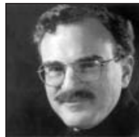
HUGH DAVSON DISTINGUISHED LECTURESHIP OF THE CELL AND MOLECULAR PHYSIOLOGY SECTION

Randy Schekman Univ. of California, Berkeley