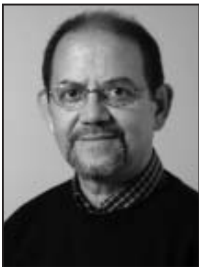
AUGUST KROGH DISTINGUISHED LECTURESHIP OF THE COMPARATIVE PHYSIOLOGY SECTION