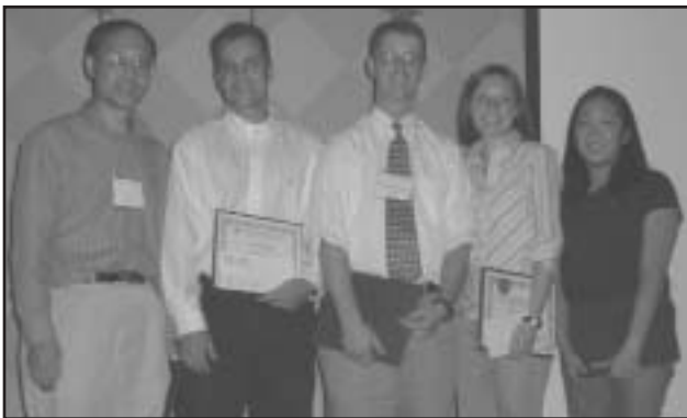
Several of the Research Recognition Award winners accepting their awards at the closing banquet.

The meeting closed with a Banquet and Awards Presentation, where the organizing committee presented the winners of the Research Recognition Award for Outstanding Abstract