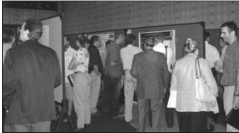
Attendees mingle and discuss the poster presentations of their colleagues.