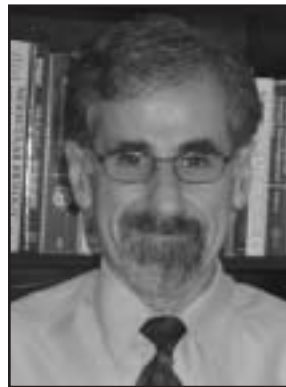
JULIUS H. COMROE, JR. DISTINGUISHED LECTURESHIP OF THE RESPIRATION SECTION