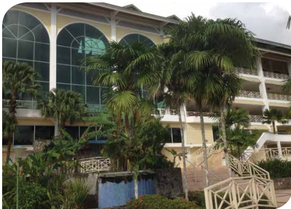
Gamboa Rainforest Resort Hotel