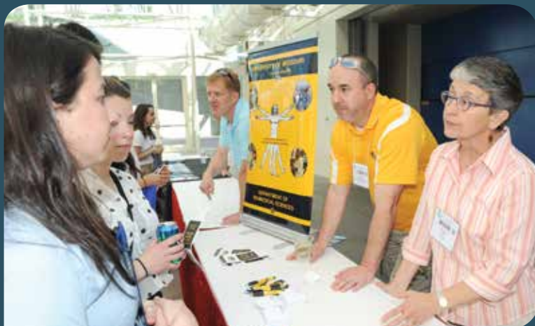
Graduate departments and programs talk with undergraduate students about advance degree opportunities at their institutions

Graduate programs, don't miss the opportunity to recruit undergraduate students for your next graduate student cohort.