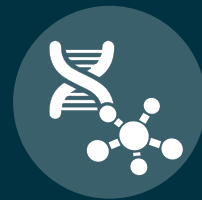
Cell and Molecular Physiology