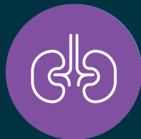
Endocrinology, Metabolism and Renal Science