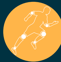
Exercise and Applied Physiology